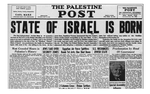
ISRAEL, THE NATION BORN IN A DAY ISAIAH 66:8

beginning with their dispersion over 26 or 27 hundred years ago, and bringing us up to the very hour we now live in.