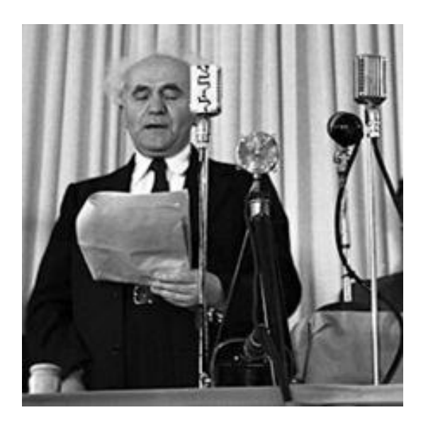
May 14, 1948 - Ben Gurion reads Israel's Declaration of Independence.