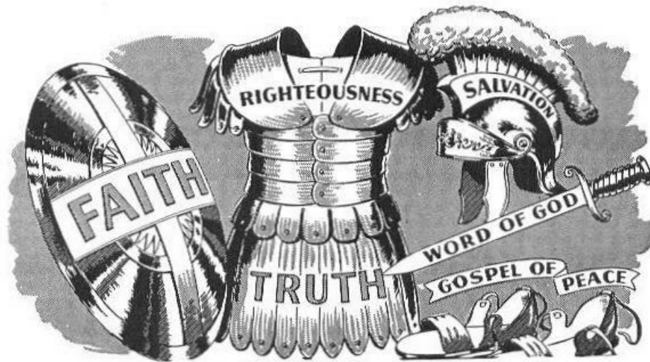
The successful Christian will avail himself of every offensive and defensive means to combat the onslaughts of the evil one. The Apostle Paul lists the Christian's armor in Ephesians 6:13-17.

state of spiritual darkness, and neither group has any idea at all as to whether the coming of Jesus is close at hand or not, from the standpoint of the scriptures. They have no spiritual armor whatsoever, but we are exhorted to put on the whole armor of God, keep awake, be sober, love one another, and comfort one another with the words of our hope of salvation,