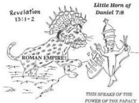
THE BEAST WITH SEVEN HEADS AND TEN HORNS