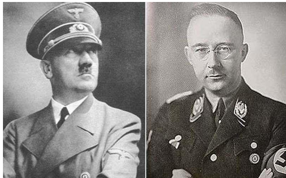
Adolph Hitler and Adolph Eichmann, Two Ruthless German Leaders Directly Responsible for Butchering 6 Million Jews. Thus Causing The Living Jews To Go Back To Palestine.