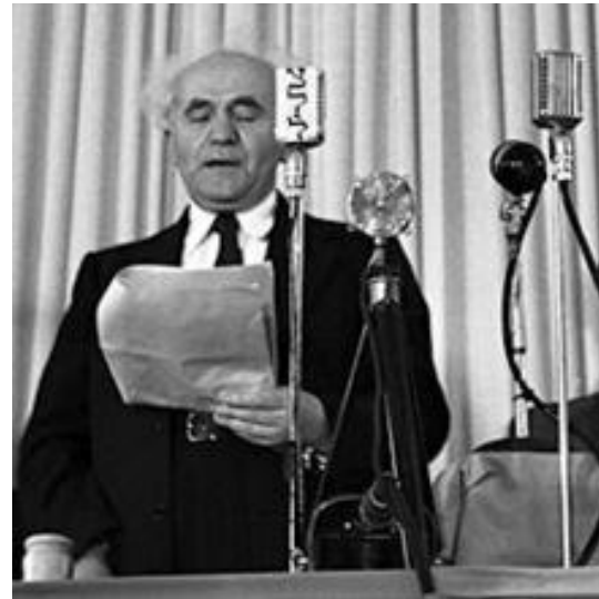
May 14, 1948 - Ben Gurion reads Israel's Declaration of Independence.