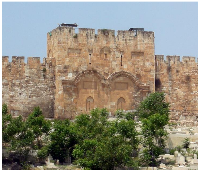
The Eastern Gate as it appears today. This gate was built in 520 AD by the Roman government.

the materials that went into the building of the temple, if it were in our days, it would be billions of dollars. The beauty of it is going to be amazing. God is not cheap. He said all the silver is mine, all the gold is mine. China, you do not have it. The sons of strangers will build up thy walls. What we see in Revelation 11 is all you got before the Millennium starts. You have the temple and the altar, and that is all. But as the Millennium gets underway, all the rest of this will be built. “And the little chambers of the gate eastward were three on this side, and three on