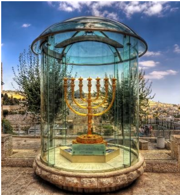
This menorah is located near the Temple Mount and has been prepared for the third temple by the Temple Institute. Two Olive trees have been planted next to it.

lamps, which are upon the top thereof.” Seven pipes, with the lights on top of them. It is a Menorah. In the next verse we see what feeds them their oil. “And two olive trees by it, one upon the right side of the bowl, and the other upon the left side thereof. So, I answered and spake to the angel that talked with me, saying, What are these, my lord? Then the angel that talked with me answered and said unto me, Knowest thou not what these be? And I said, No, my lord. Then he answered and spake unto me,