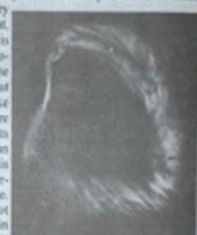
Mystery vital in sun in Life Magazine, May 17, 1960