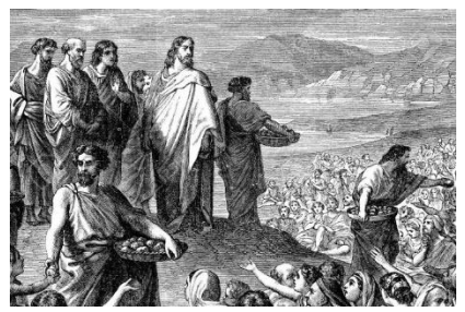
The feeding of the five-thousand