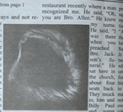
Mystery cloud as seen in Life Magazine May 12, 1963