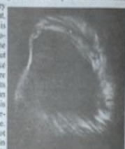
Mystery visit in sun in 1st Magazine May 11, 1963

Continued from page 1 holding it sideways and not realizing what they were looking at, because that is the way the photo was in the magazine. But when you take this picture here and turn it on its side, you can clearly see that the Lord has a certain shape in mind for His people. It looks like the face as though they were part of the congregation and smack in the middle of the church. The regular congregation get seats in the church before the visitors, because there were not enough seats for everyone. They think it is part of the