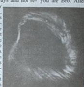
Mystery cloud as seen in Life Magazine May 12, 1963