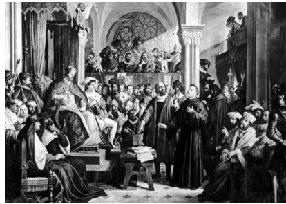
Trial of Martin Luther

suffer torture and death as had the other martyrs who rose against the church. Germany had waited for someone to put into words what everyone was thinking but was afraid to say concerning the sale of indulgences and other abuses. Luther was tried and found guilty by the church but was protected – from the fury of the religious court.