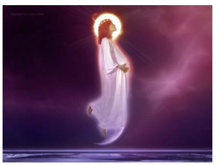
Revelation 12, Woman With Child clothed in the sun with the moon under her feet, representing the nation of Israel

THE WOMAN OF REVELATION 12:1, HAS BEEN ONE OF THE GREAT MYSTERIES OF BIBLE: AS FAR AS THE GENTILE WORLD CHURCH CONCERNED. THEY HAVE EVERYTHING CALLED HER EXCEPT WHAT, OR WHO SHE REALLY IS. NATURALLY HER TRUE IDENTITY IS SEEN THROUGH EYES THAT HAVE BEEN ENLIGHTENED BY THE HOLY SPIRIT: BUT ONCE YOU SEE IT. EVERYTHING PERFECTLY IN PLACE, AS YOU READ THE FOLLOWING VERSES. THAT OF COURSE, IS ANOTHER